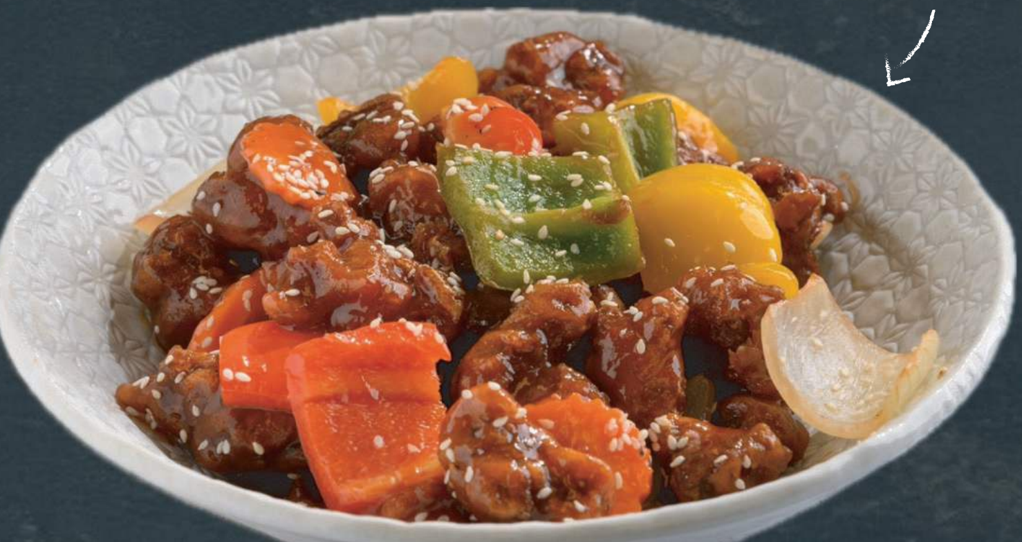
VIETNAMESE SWEET & SOUR PORK

Vietnamese style marinated grilled pork chops with salads