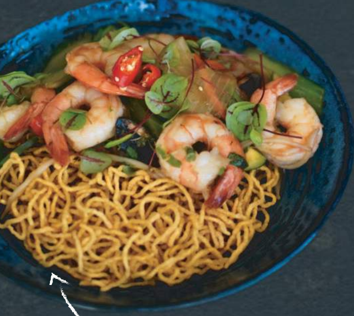
KING PRAWN CRISPY EGG NOODLE