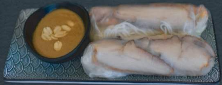
ROAST PORK RICE PAPER ROLL