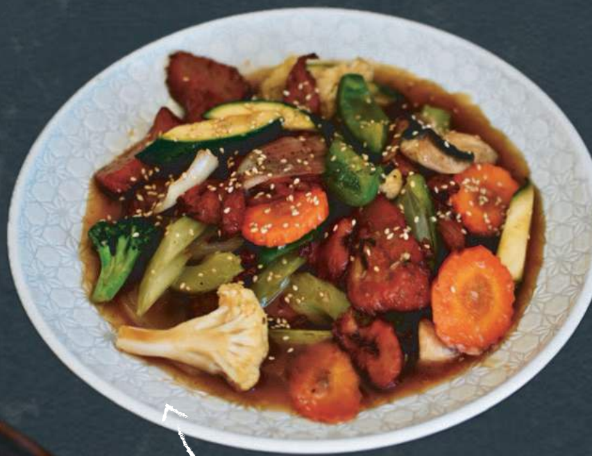
VEGAN BBQ WITH PLUM SAUCE