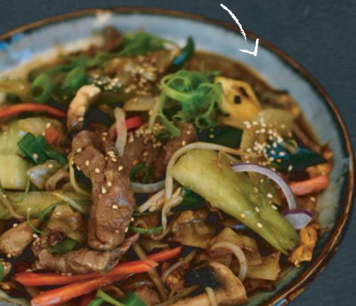
BEEF FLAT RICE NOODLE